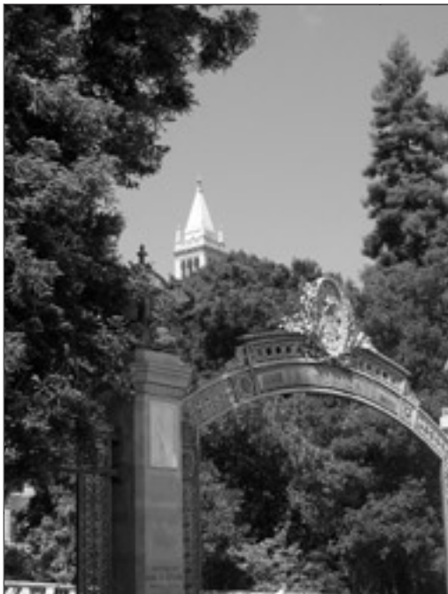
Sather Gate, at the center of the Cal campus

The scope of the curriculum, the pace at which courses proceed, and the faculty's high expectations require that students attend every class meeting. Even one absence makes it very difficult to keep pace and also makes it difficult for the instructor to recommend that the student receive credit for completion of courses in the Secondary Division. Students cannot miss the first two days of class. Students who incur more than two absences for any reason may be dropped from the program, will not receive a recommendation for credit, and will not be due a tuition refund.