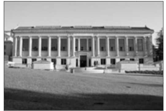
Doe Library, UC Berkeley's main library

in the program. It is advantageous for returning and new students to submit their complete applications early, preferably well before the postmark deadlines. The date an application is complete can be an important factor in determining course placement. Generally, applications are evaluated in the order they are complete, with first preference in placement given to returning students; incomplete applications are not considered for placement. However, returning students are not guaranteed automatic readmission or placement in their first choice of course—they must have maintained strong academic records, and must submit their complete applications early. A student who applied in a previous year and then withdrew without completing a course will be considered a new student for admission purposes. Applications received after the deadline will be considered only on a space-available basis.