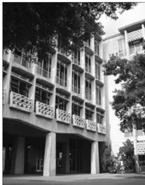
Tolman Hall, home of the ATDP

ATDP also invites students to participate in a variety of optional activities and to develop new friendships. Courses are carefully developed to contribute breadth and depth to students’ educational experiences. ATDP seeks to augment and enrich the schooling experience, not to replace what is offered in a student’s regular school. ATDP is committed to supporting gender, ethnic, and socioeconomic diversity in all of its programs.